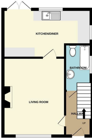
1ST FLOOR 388 sq.ft. (36.0 sq.m.) approx.